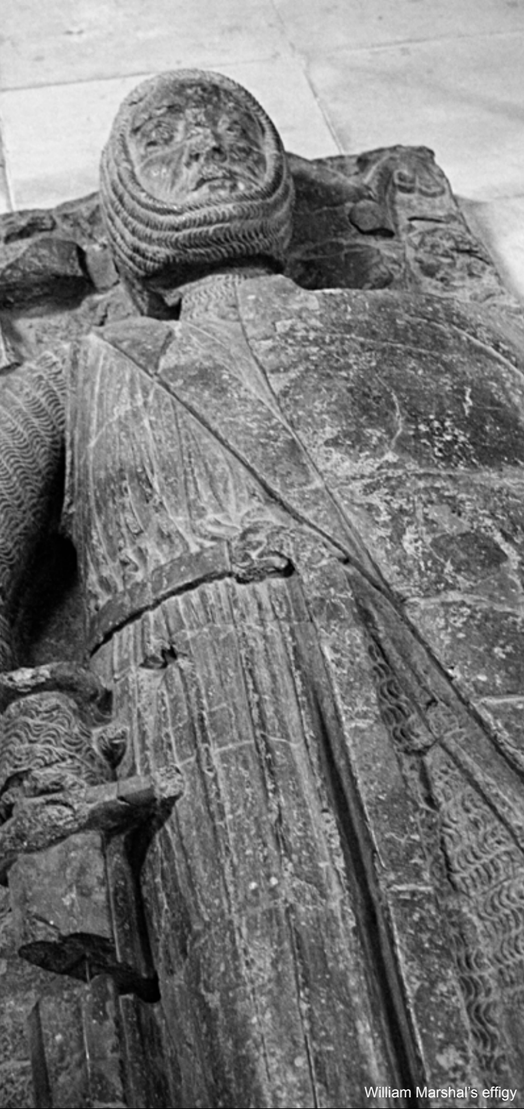
William Marshal's effigy