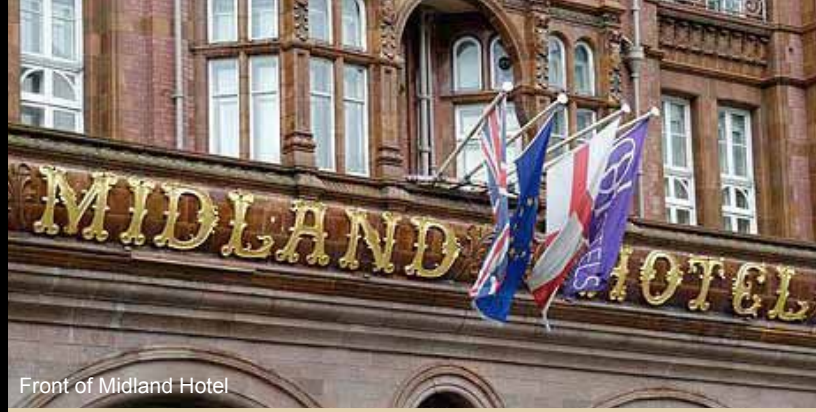
Front of Midland Hotel