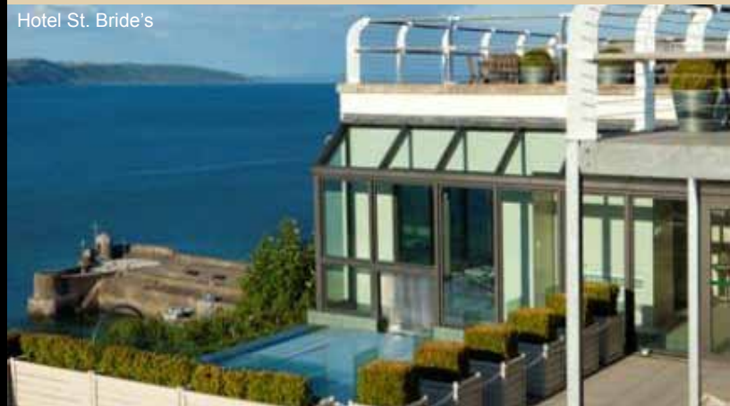
Hotel St. Bride's

Throughout our journey we'll stay in luxury boutique hotels. In Manchester, the Midland Hotel is housed in a historic building in the city center and offers fine dining and excellent service. Hotel St Bride's in Saundersfoot, Wales, is a destination spa situated on a lovely headland overlooking the harbor. You'll enjoy full spa services, an art gallery, and luxury rooms. Near Bath we stay at the Beechfield House Hotel, a late-Victorian era country house on 8 acres of beautiful grounds. In London, stay at the ...[hotel in London]