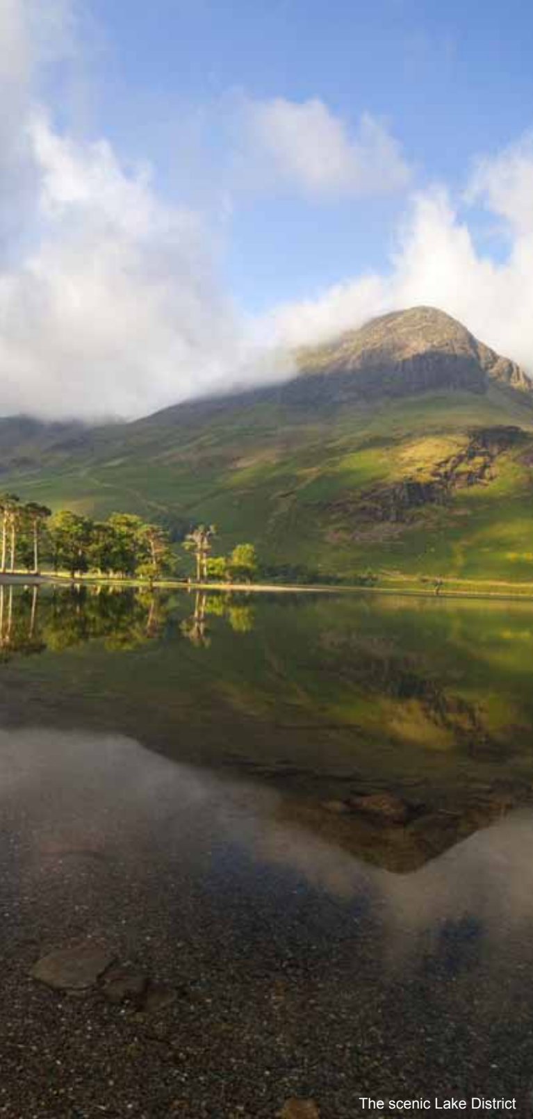
The scenic Lake District